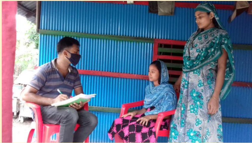
Sponsor child Selection process

Helping children in need – not for charity but focus on needs – towards a rights-based, sustainable approach that benefits children. Our community-based child sponsorship aims to see the rights of children become a reality. We are committed to working with the duty bearers to break the structural causes of poverty and exclusion that are hindering the