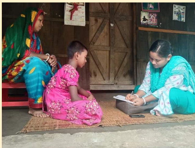
Registering a Child in Sponsorship Program

Sponsoring a child offers the opportunity to make a long-standing commitment in favor of children's rights. In this relation, children take the lead role as experts of their social situation and as subjects of their own development. A sponsored child is considered the ambassador of his/her community.